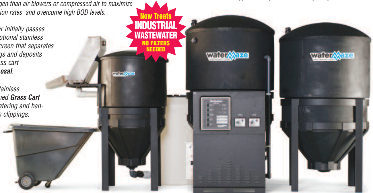
Optional cart for easy disposal of grass clippings