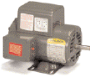
1 PHASE 56 FRAME