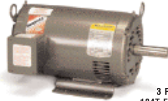
3 PHASE 184T FRAME

Industrial grade motors built specifically to meet or exceed the demands of the pressure washer industry.