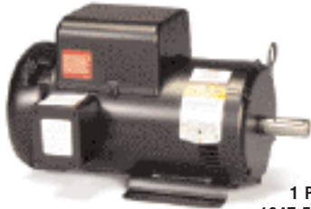
1 PHASE 184T FRAME