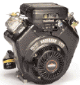
VANGUARD, V-TWIN OHV

Briggs & Stratton's top-of-the-line engines have proven performance in the pressure washer industry.