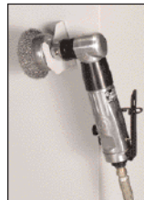
Power Scrub Brush is powered by shop's compressed air to remove carbon deposits.

Upgrades On All Models for enlarging size of the pump (5 to 7.5 or 7.5 to 10 HP) and working height of the cabinet, usually by 6" but as much as 24" for extra-large models