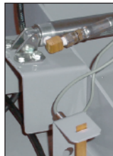
Fresh-Water Rinse injects water from the tap for rinsing of parts (factory install)