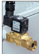
Auto-Water Fill automatically replenishes tank should water level drop