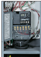
7-Day Timer turns heater and skimmer on and off at pre-set times