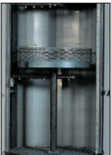
Dual Turntable adds a second turntable for greater capacity (factory installed)