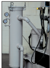
Sump Sweep & Filter blasts sediment from sump floor and filters it (filter available alone)