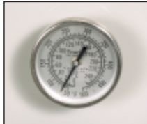
Temperature Gauge monitors temperature of cleaning solution.

• Bag Filtration extends life of cleaning solution by filtering suspended solids