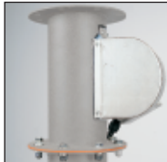
Steam Exhaust Fan enhances steam vapor extraction