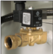
Auto Water Fill replenishes tank water level automatically