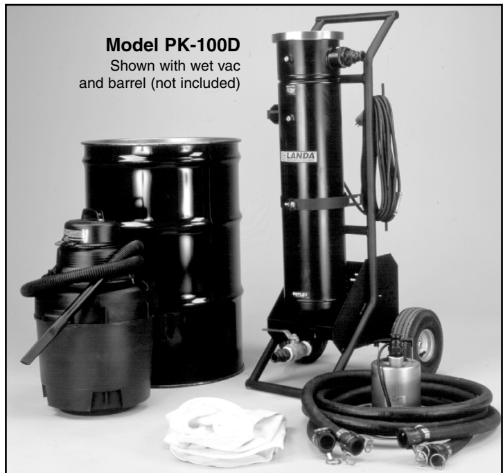
Model PK-100D Shown with wet vac and barrel (not included)

sludge in the wet vac is then poured into the bag for dewatering. After it dries, the customer can dispose of it or store for disposal at a later time.