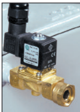
Auto-Water Fill automatically replenishes tank should water level drop