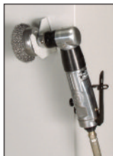
Power Scrub Brush is powered by shop compressed air to remove carbon deposits.