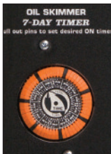
7-Day Timer turns oil skimmer on/off at pre-set times for ease of maintenance