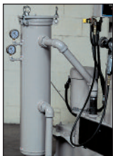
Sump Sweep & Filter blasts sediment from sump floor and filters it (filter available alone)

* Models are also available with stainless steel upgrades to wetted surfaces and 208V and 575V electrical configurations.