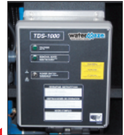
The TDS-1000 Control Box attaches easily to the CLP or Delta railing.