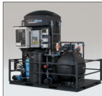
AMC-3000 Kit for CLP: Automatically backwashes filters and purges tank