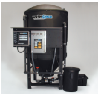
AMC-1000 Kit for CL Systems: Automatically purges cone bottom tank