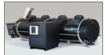
AMC-1100 for WaterStax Systems: Automatically purges the first bioremediation tank