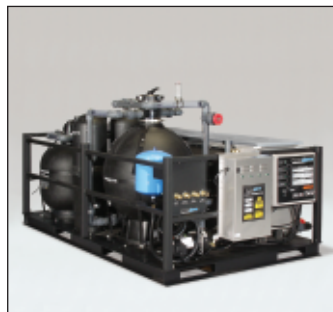
AMC-2000 Kit for Delta Systems: Automatically backwashes filters