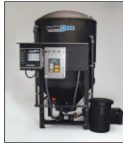
■ CL-600 Discharge System