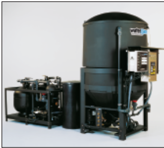
■ CL-603 with Filter Pac III Recycle System

Flow Rates of up to 30 GPM | Compact Footprint | Self-Contained Yet Modular Flexibility | Above Ground Design