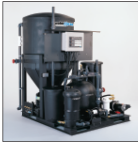
■ CL-304 Extra-Compact Recycle System