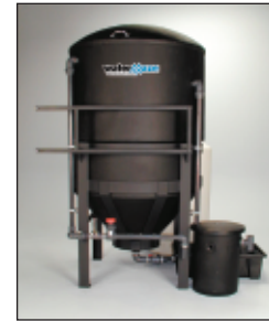
■ CL-30 Pre-Treatment Solids Separator